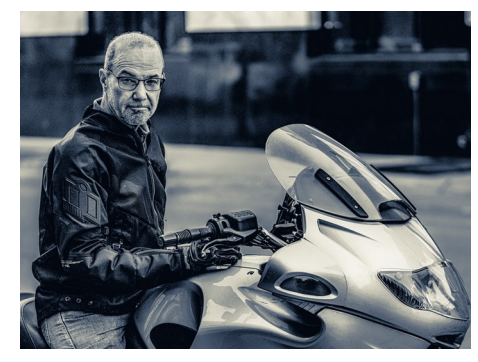
© 2023 Alan Binder. Used with permission.

Just wanted to send out a reminder that Motorcycle Night is next Thursday, August 8th at Jimmy John's Field. Please have your club members plan on arriving by 5:30pm to line up to