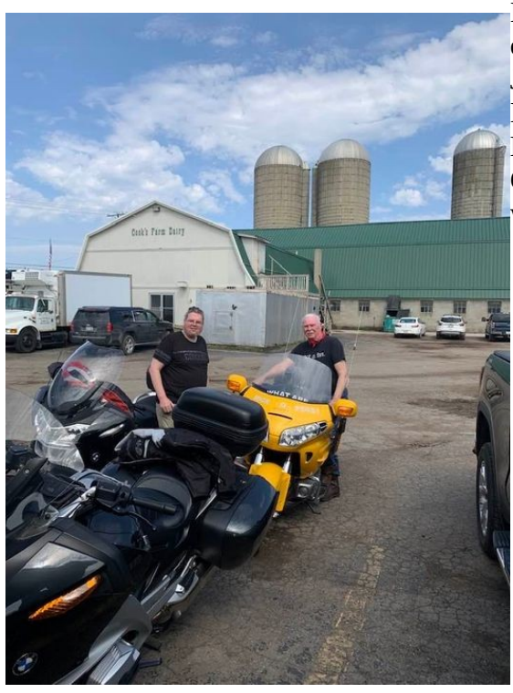
(continued, next page)