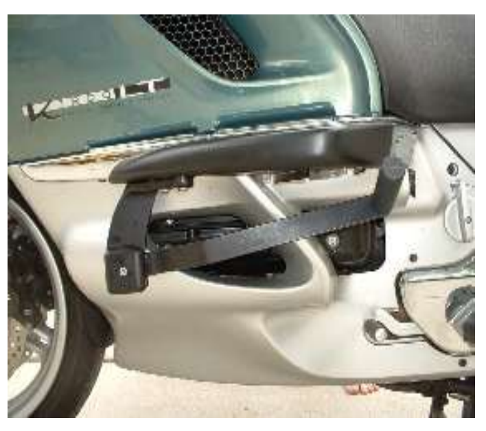
BMW Logo is a registered trademark of BMW North America