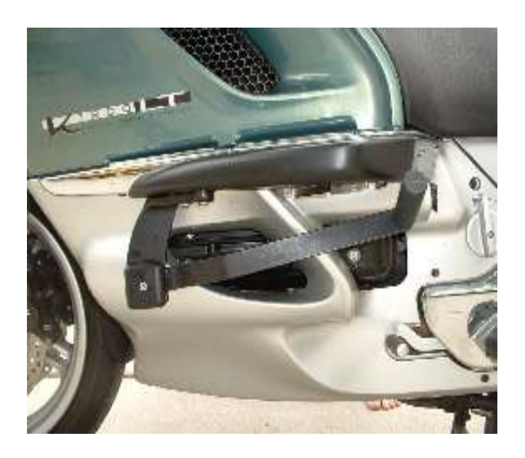
BMW Logo is a registered trademark of BMW North America