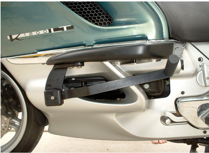
BMW Logo is a registered trademark of BMW North America