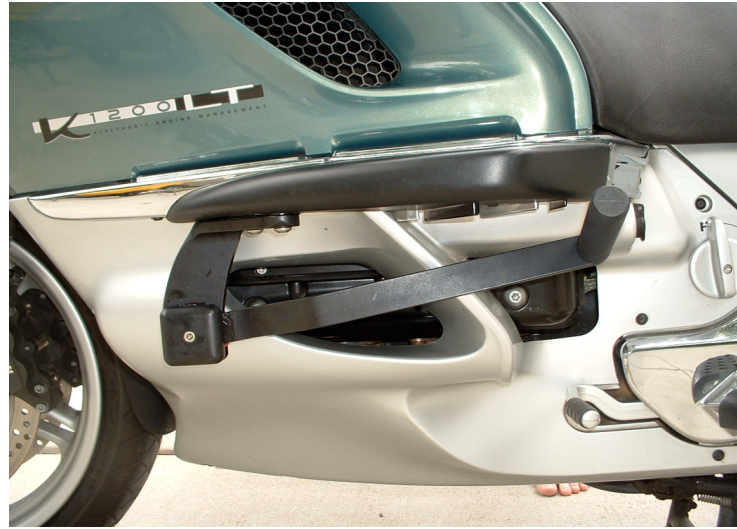
BMW Logo is a registered trademark of BMW North America