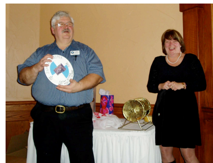
Outgoing & incoming presidents passing the baton so to speak