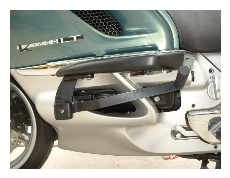
BMW Logo is a registered trademark of BMW North America

Spring Loaded Highway Pegs for your R1200RT or your K1200LT. Look at <a href="https://www.ridingiswonderful.com">www.ridingiswonderful.com</a> to find information.