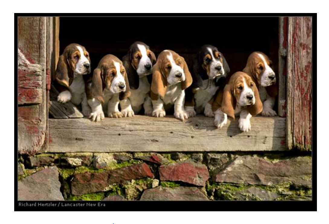
My dog Daisy (2<sup>nd</sup> from left) and her brothers and sisters are very worried about the current economy. ALPO is up to $3.00 a can. That's almost $21.00 in dog money.

If you have the same urge to ride this time of the year as me, you're taking advantage of the "weather windows" our fickle climate offers during the usually unrideable January and February. Even if it's only for an hour after work or a couple on the weekend, the opportunity to flex your BMW's muscles feels great, both physically and mentally. If you ride, make sure you get the bike up to full operating temperature - don't just ride around the block. Either RIDE it, or don't even start it. Fortunately most of the opportunities have followed a street cleansing rain to help wash away the salt dust. If you have been fortunate enough to take your bike to warmer climates...well...I'm jealous. We're ALL jealous. But "good on 'ya, mate". I suspect winter has returned however, so now's a good time to catch up on your reading and planning for the national rally in Vermont.