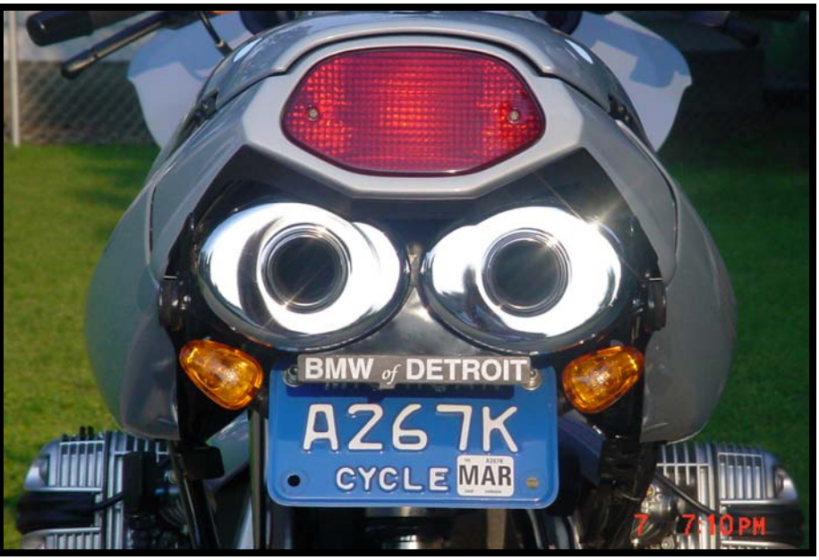
Does anyone ever get tired of looking at an attractive rear end?

that I'm the least bit biased!) AND... we still have one 2005 R1200ST left; still available at a SMOKIN' price!