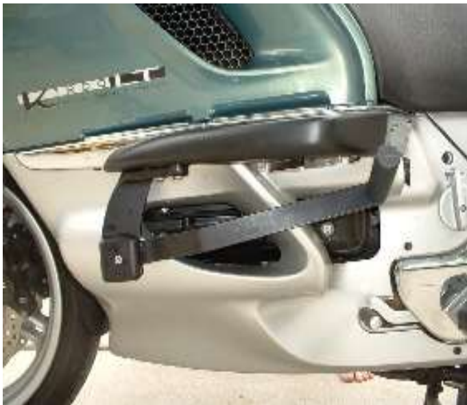
BMW Logo is a registered trademark of BMW North America