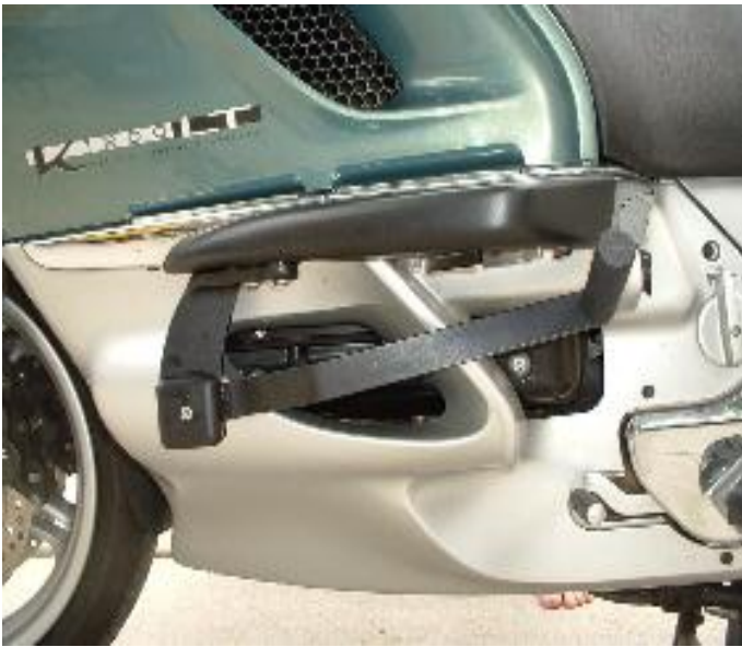
BMW Logo is a registered trademark of BMW North America